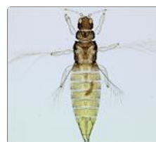
Female - teneral

Male sternites III–VII each with a pore plate.