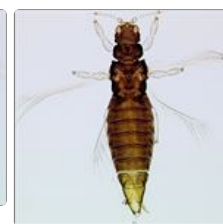
Female - mature