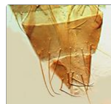
bifurcus holotype tergites IX-X