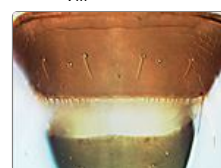
loti tergite VIII