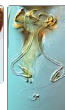
loti male genitalia