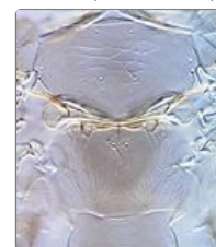
perplexus meso & metanota