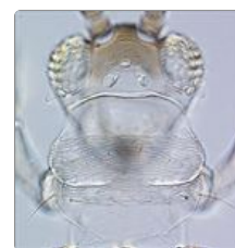
bhattii head & pronotum [M.Masumoto]