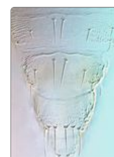
mori tergites VII-X