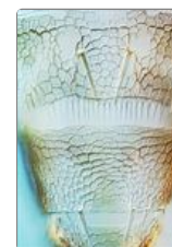
javanicus tergites VIII-IX