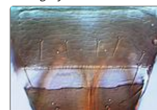
longistylosus tergite VIII