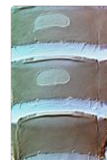
cardamomi male sternites VI-VIII