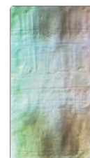
sulcatus meso & meta furcae sulcatus tergites I-III sulcatus tergites VI-VIII