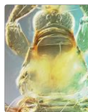
pasekamui head & pronotum