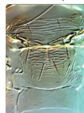
pasekamui meso & metanota