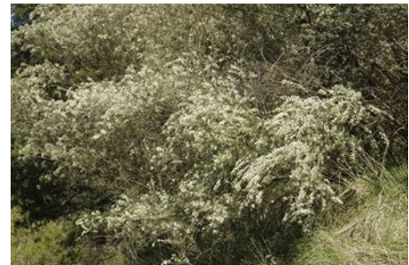
Figure 4. A group of tagasaste trees with branches bending down gracefully and fully loaded with densely packed flowers. All photos (except Figure 5) by LE Newstrom-Lloyd © Trees for Bees NZ.