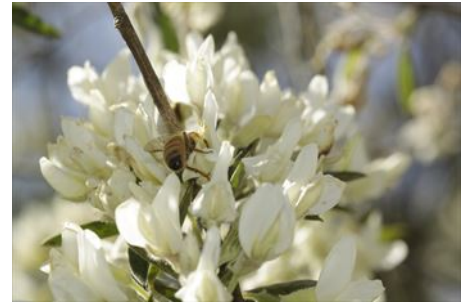
Figure 1. The floral display of tagasaste branches are composed of densely packed flowers in various stages of opening.

Chamaecytisus palmensis is usually called tree lucerne but another commonly used name is tagasaste . It is often confused with tree lupin ( Lupinus arboreus ) and also with another fodder legume, Medicago arborea , also known as tree