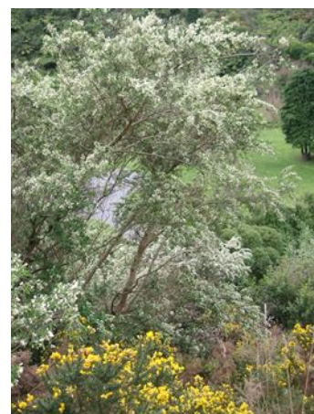
Figure 5. Tagasaste flowering in early spring, growing as a tall shrub with gorse in the foreground.