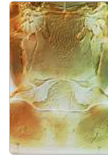
ananthakrishnani metanotum & pelta