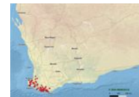
Caladenia brownii distribution