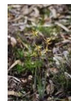
Caladenia caesarea subsp. 'Mooradung'

(ver: April 2024)