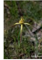
Caladenia caesarea subsp. 'Mooradung'