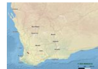
Caladenia caesarea subsp. 'Mooradung' distribution