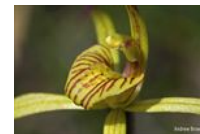
Caladenia caesarea subsp. 'Mooradung'