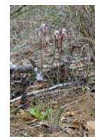
Caladenia denticulata subsp. rubella

Copyright © 2024. WANOSCG All rights reserved. (ver: April 2024)