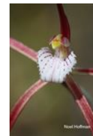
Caladenia denticulata subsp. rubella