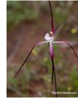
Caladenia denticulata subsp. rubella