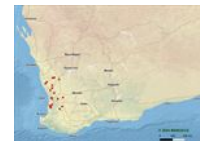
Caladenia denticulata subsp. rubella distribution