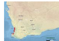
Caladenia huegelii distribution