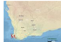
Caladenia infundibularis distribution