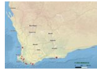
Cyrtostylis tenuissima distribution