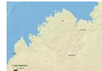
Dendrobium foelschei distribution