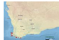
Diuris jonesii distribution