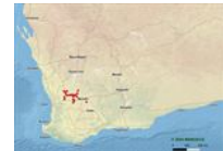
Diuris suffusa distribution