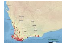
Drakaea glyptodon distribution