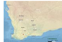
Drakaea isolata distribution