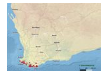
Drakaea thynniphila distribution