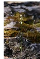
Eriochilus dilatatus subsp. dilatatus