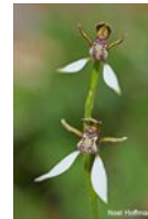
Eriochilus dilatatus subsp. dilatatus