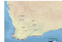
Eriochilus dilatatus subsp. dilatatus distribution