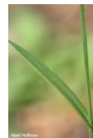
Eriochilus dilatatus subsp. dilatatus

Copyright © 2024. WANOSCG All rights reserved. (ver: April 2024)