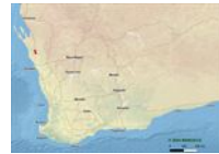
Paracaleana alcockii distribution