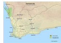
Pterostylis argillacea distribution