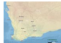
Thelymitra sp. 'late south coast' distribution