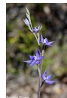
Thelymitra sp. 'late south coast'

Copyright © 2024. WANOSCG All rights reserved. (ver: April 2024)